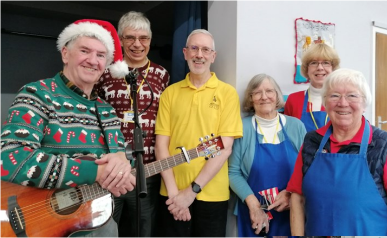
Here are some of the team looking festive!