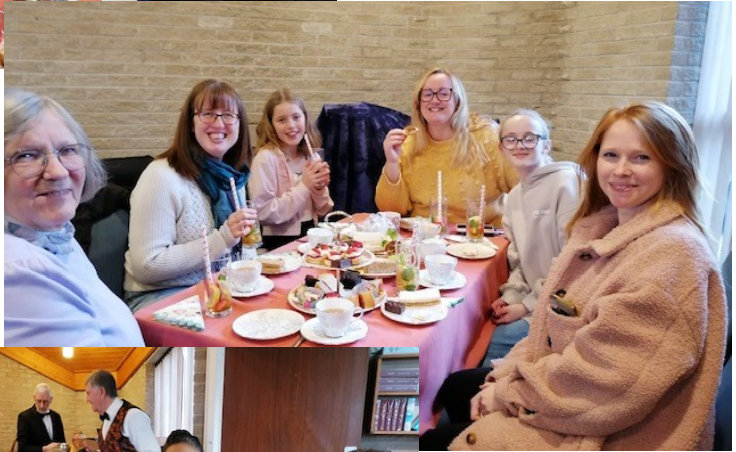
And here's a few of us enjoying the treats!!